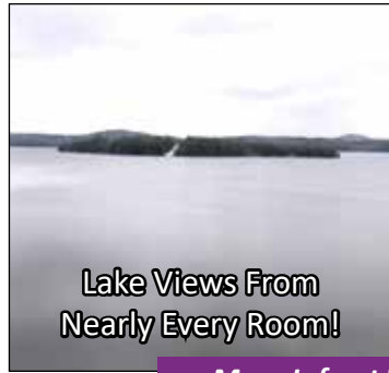
Lake Views From Nearly Every Room!